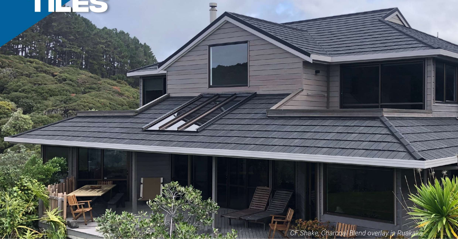
CF Shake, Charcoal Blend overlay in Ruakaka